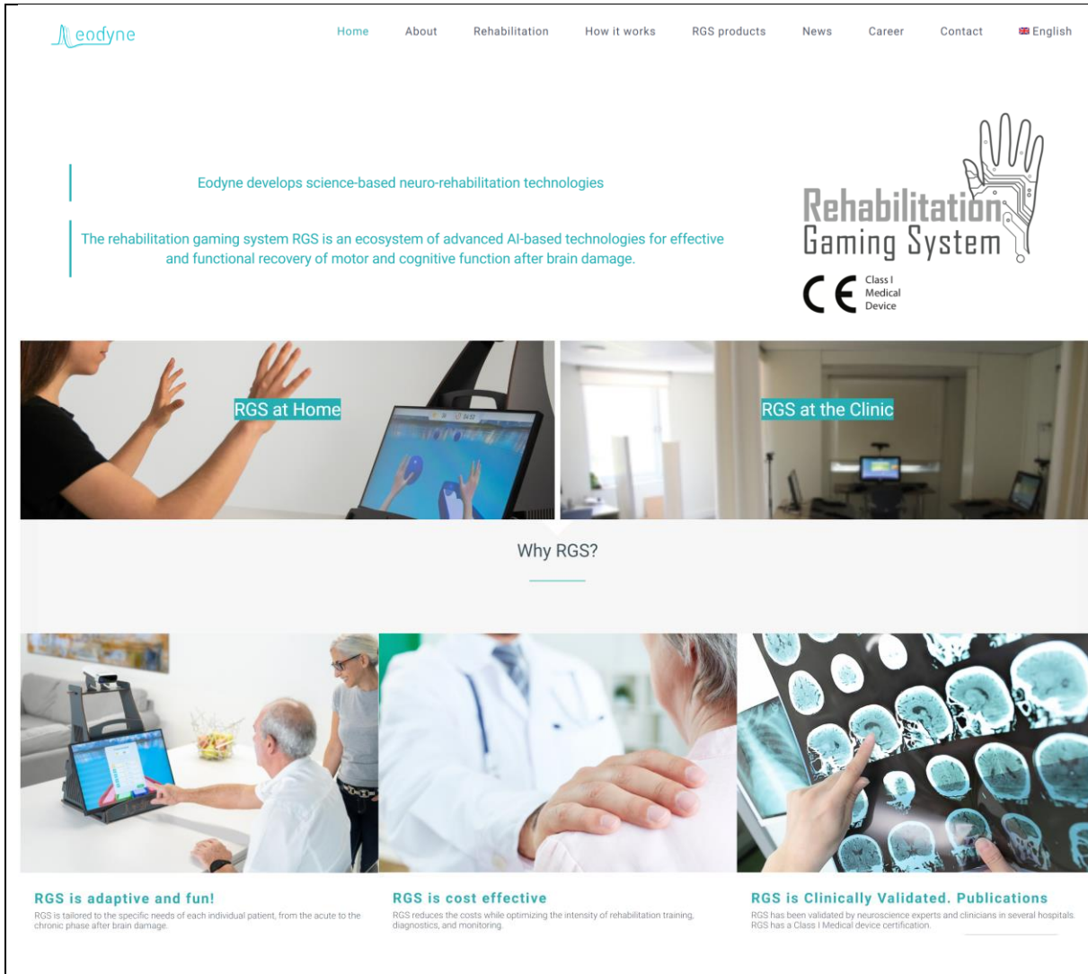
Figure 2: Screenshot Eodyne website - Rehabilitation Gaming System ( https://www.eodyne.com/ )

Further videos will be published on the AISN website. The overall goal of the planned patient testimonials and information videos will actively inform patients and carers to create trust in and acceptance of AI assisted rehabilitation, and finally to support the patient recruiting. These videos will be produced as soon as the AISN development comes close to the clinical trial. Information on rehabilitation methods in general will be provided on the public website in 2023 already with focus on the Rehabilitation Gaming System by AISN partner Eodyne Systems.